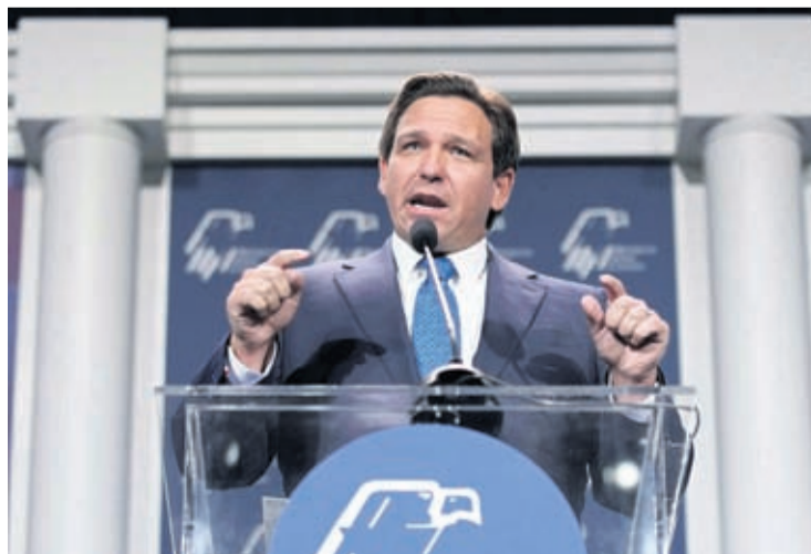
Florida Gov. Ron DeSantis speaks on Nov. 19, 2022, in Las Vegas.

He said that some people have lost faith in public health institutions, including the U.S. Centers for Disease Control and Prevention over the course of the pandemic. The governor has frequently spoken against CDC directives, including mask and vaccine mandates, and filed lawsuits to stop many from taking effect in Florida. □